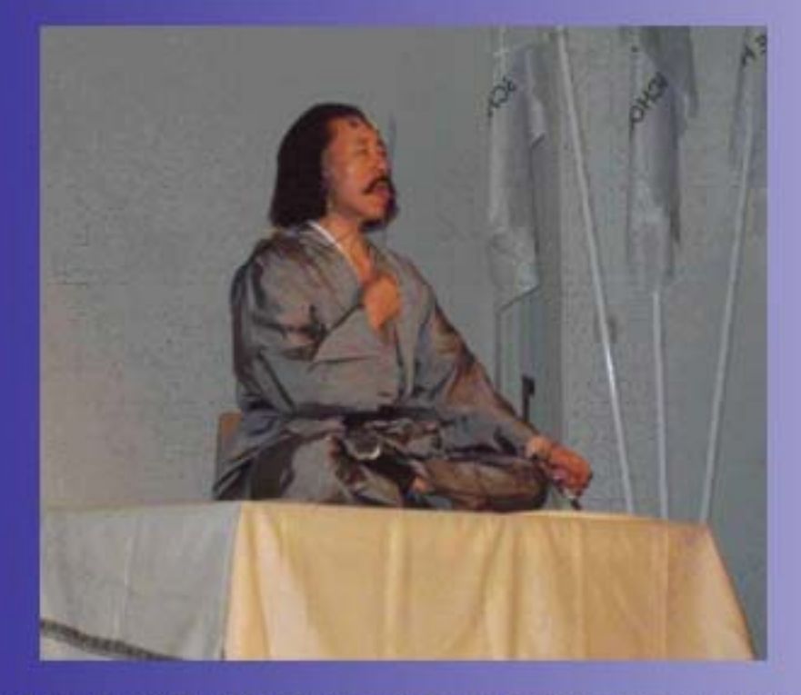
the magazine for mind-body medicine

Argue for your limitations and sure enough they're yours. R.Bach